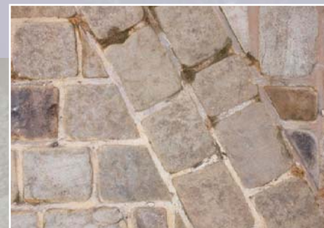
Yorkstone Cobbles Tumbled Coursed widths x random lengths Product code: LQ 5135