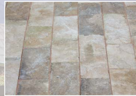
Purbeck Riven Pavers Natural Riven 100/150/200mm x R Product code: LQ 5137