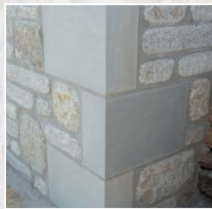
Sawn and Rubbed Quoins Product code: LQ 5152