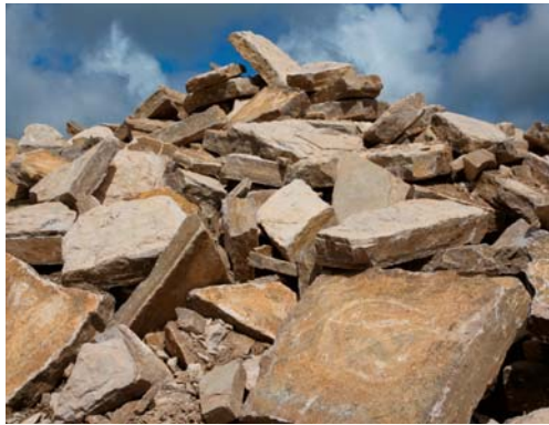
Landscape Slab Product code: LQ 5157