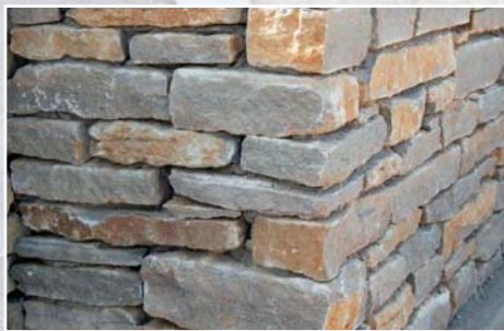
Forest Marble Guillotined Building/Walling Stone Height 30-70mm. Depth 125mm x R Product code: LQ 5153