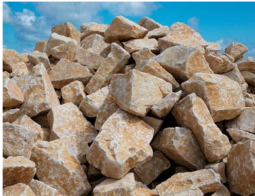
Purbeck Rockery Stone Natural Small: 10kg-20kg pieces Medium: 25-75kg pieces Product code: LQ 5147