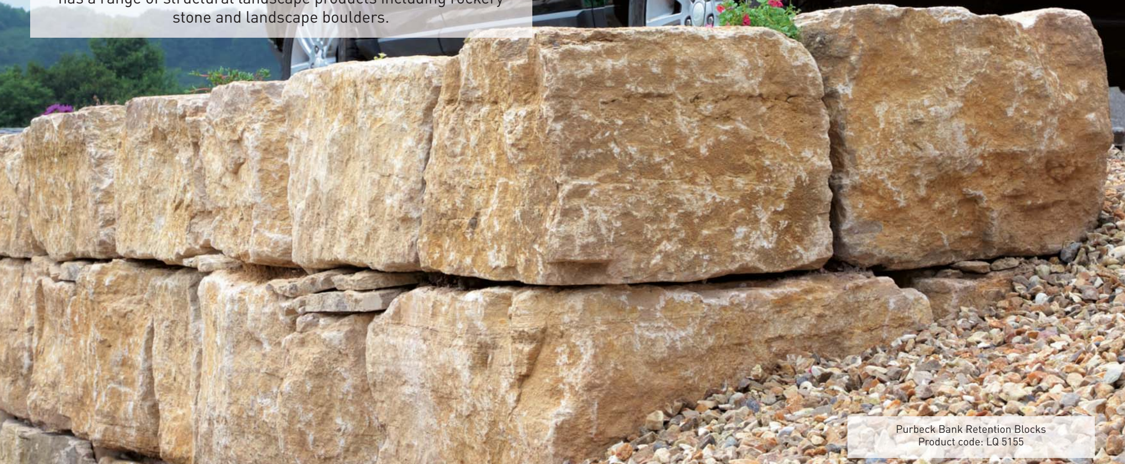
Purbeck Bank Retention Blocks Product code: LQ 5155