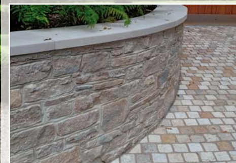
Purbeck Setts Sawn/Riven and Sawn/Tumbled 100x100x100mm or 100x100x30-50mm Product code: LQ 5133