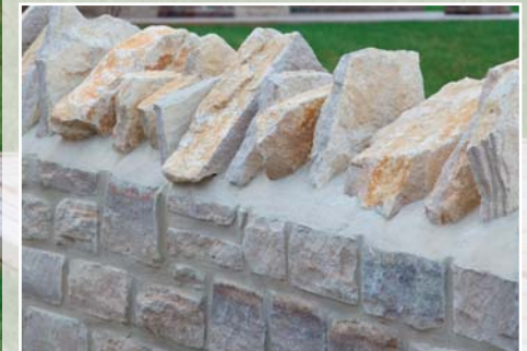
Purbeck Cock & Hen copings Product code: LQ 5129