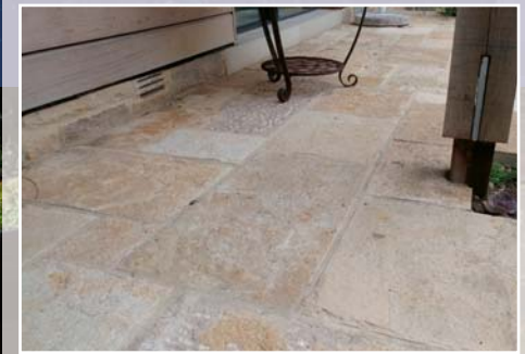
Purbeck Riven Paving Natural riven RxR. 30-50mm thick. Product code: LQ 5141