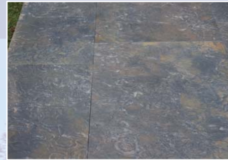
Dunster Natural 600mm x Random and R x R. Depth 20-30mm. Product code: LQ 5136