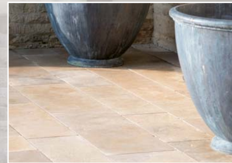
Purbeck Estate Paving Smooth and textured surfaces with dressed edges 200/300/400 x Random. 30mm Depth. Product code: LQ 5139