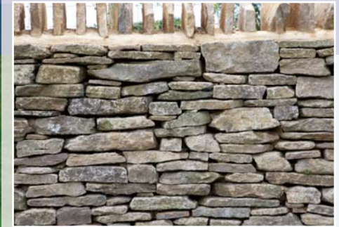
Purbeck Dry Stone Walling Split face/natural RxR Product code: LQ 5125