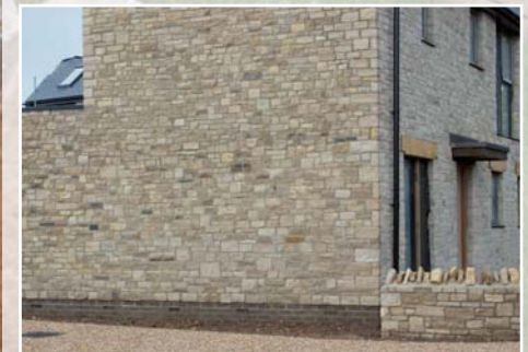
Purbeck Guillotined Building Stone RxR Split face/natural Product code: LQ 5126