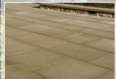
Yorkstone Sawn 600 x Random. Depth 40mm. Product code: LQ 5145