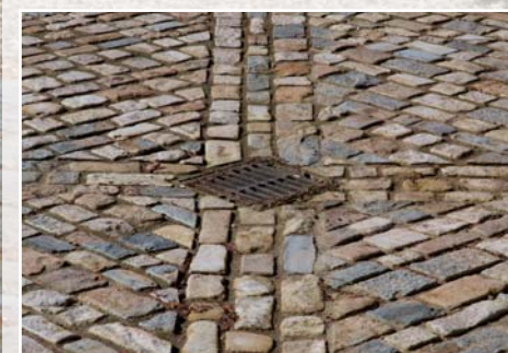
Rustic Purbeck Cobbles 65 and 140 mm coursed widths. 70-100mm depth Product code: LQ 5134