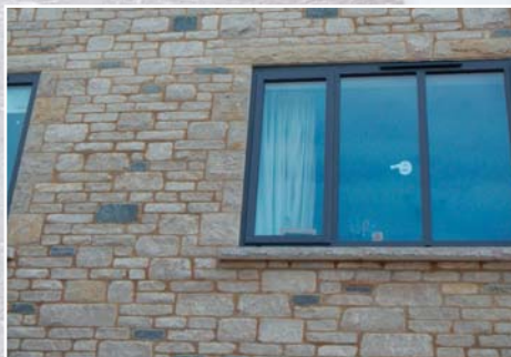
Purbeck Sawn Building Stone Sawn, guillotined and tumbled Height: 65/140/215mm. Depth 100mm x R Product code: LQ 5128