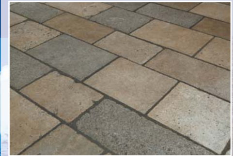
Purbeck Pavers 100/150/200mm x Random, 150x150mm, 200x200mm. Depth 25-35mm. Product code: LQ 5140