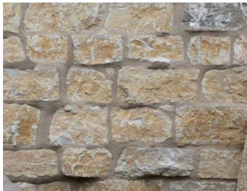
Rockface Cladding Random x Random Product code: LQ 5150