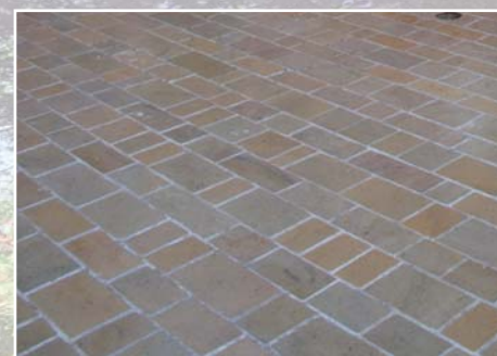
Yorkstone Pavers Natural 150 or 200mm x Random, 150x150mm, 200x200mm. Depth 30-40mm/nominal 40mm. Product code: LQ 5143