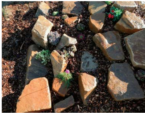
Sandmoor Rockery Stone Natural 25-75kg pieces Product code: LQ 5148