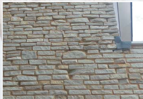
Purbeck Narrow Guillotined Building Stone Height 30-70mm. Depth 125mm x R Product code: LQ 5127