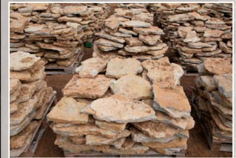
Forest Marble Crazy Paving Natural Riven 300x300 – 500x500 Product code: LQ 5151