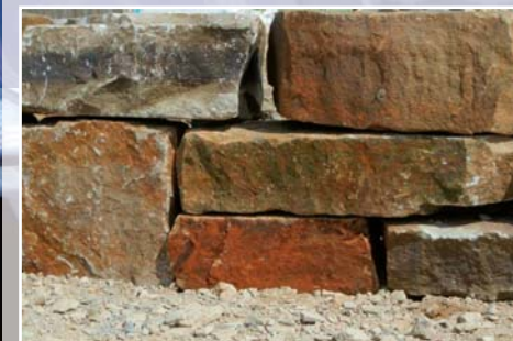
Sandmoor Bank Retention Blocks Product code: LQ 5156

Where required, Bank Retention Blocks can be supplied predrilled with holes for easy installation using traditional Lewis Pin lifting. To complement Purbeck bank retention blocks Lewis Quarries also has a range of structural landscape products including rockery stone and landscape boulders.