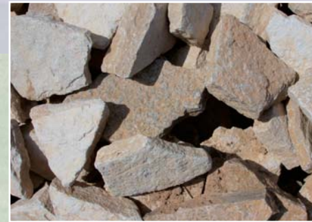
Purbeck Small Walling Stone Natural/split face RxR Product code: LQ 5154